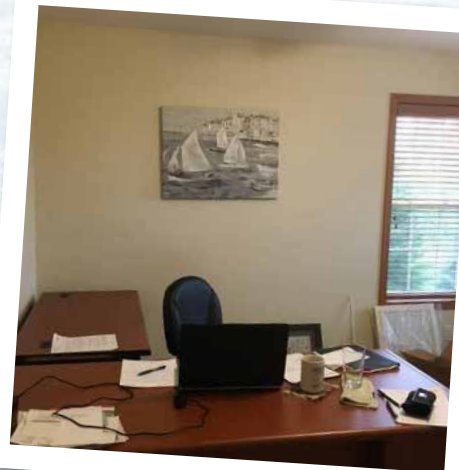
Home office is still a common view.