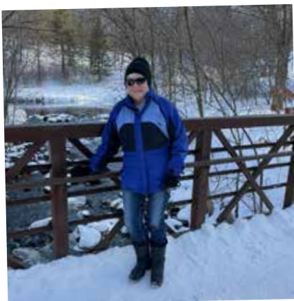
Enjoying the scenery during a hike.