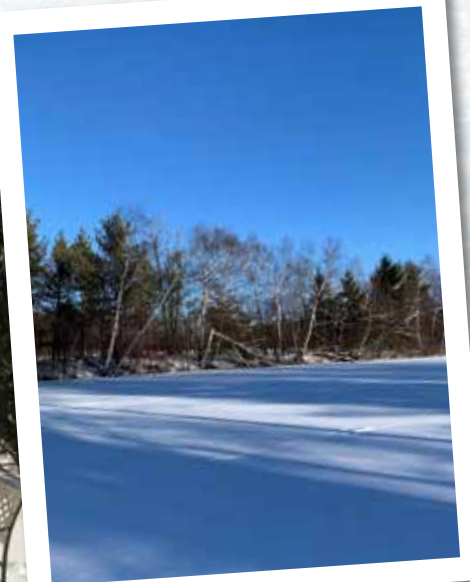
A blue sky and white snow - beautiful!