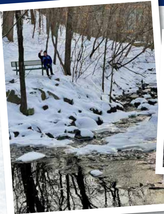
Greetings from northern Wisconsin.