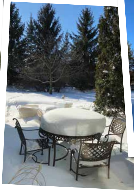
Outdoor seating in Wisconsin.