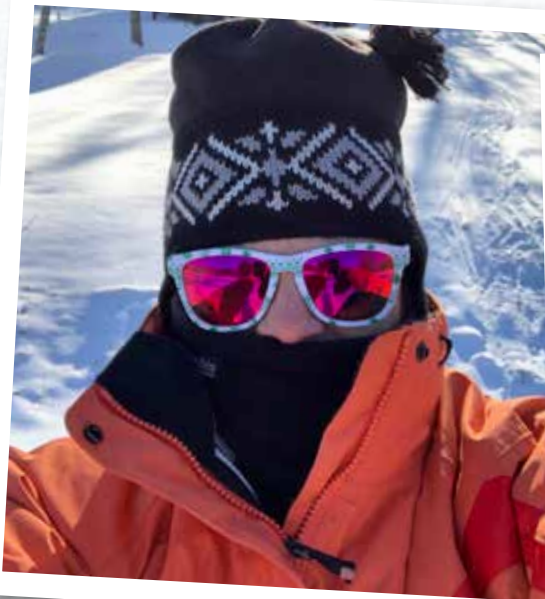
All bundled up and ready to snowshoe.