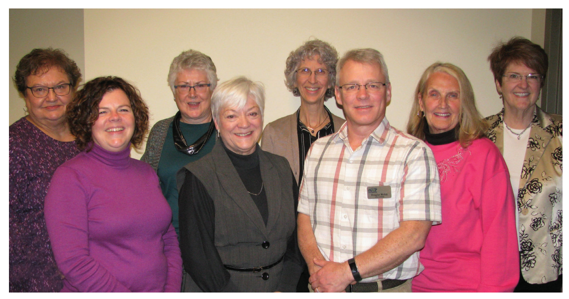
Six of our nine volunteers were able to attend the Recognition and Retreat in Madison.

The Senior Medicare Patrol recently held a two-day recognition and retreat in Madison to thank the volunteers for their commitment to and support of the program. The event was an opportunity to bring everyone together for team building and training, facilitating valuable face-to-face interactions that are difficult given that our volunteers are spread around the state. Since the program was awarded to GWAAR in June 2018, we have been busy building the volunteer base, and are pleased to have nine dedicated volunteers on board.