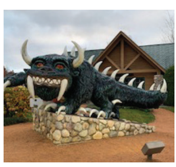
This Hodag in Rhinelander is one of the many attractions SMP encounters during our travels around the state.