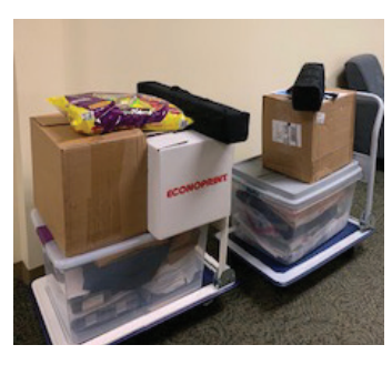
Carts loaded for two different events is now a familiar sight in the SMP office.